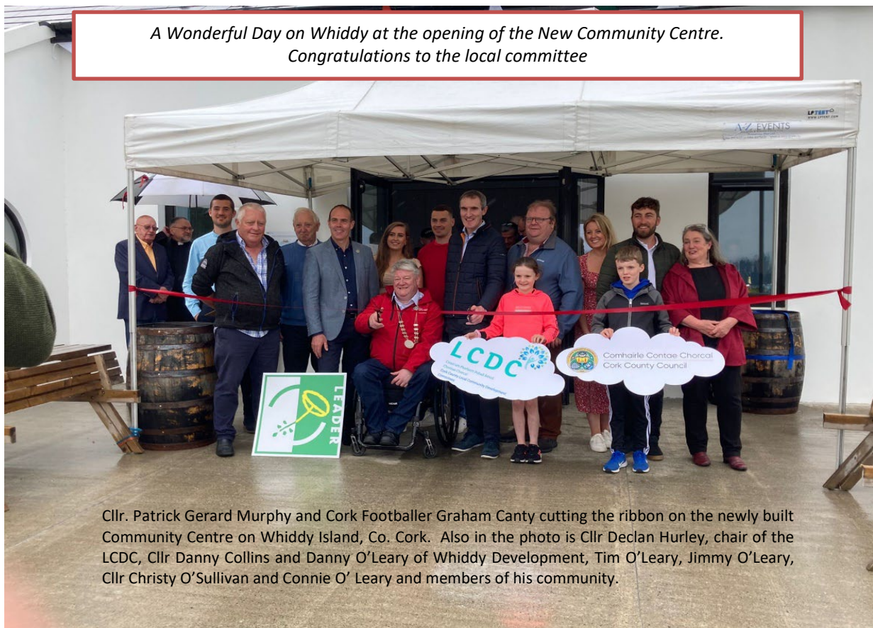
A Wonderful Day on Whiddy at the opening of the New Community Centre. Congratulations to the local committee