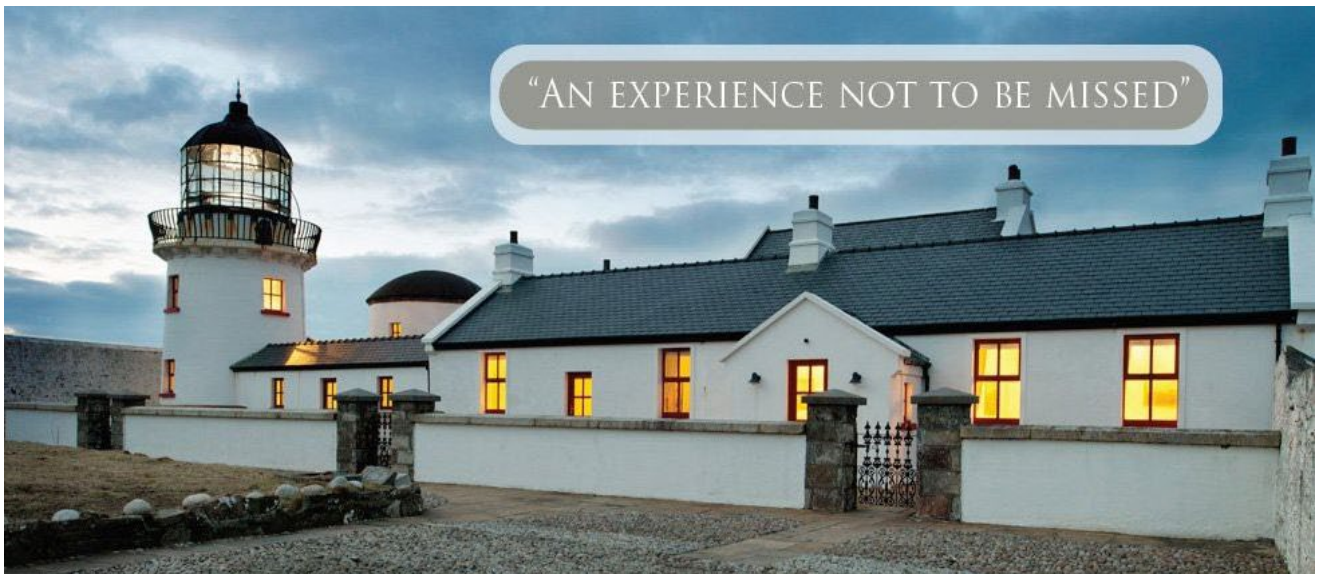
Clare Island Lighthouse