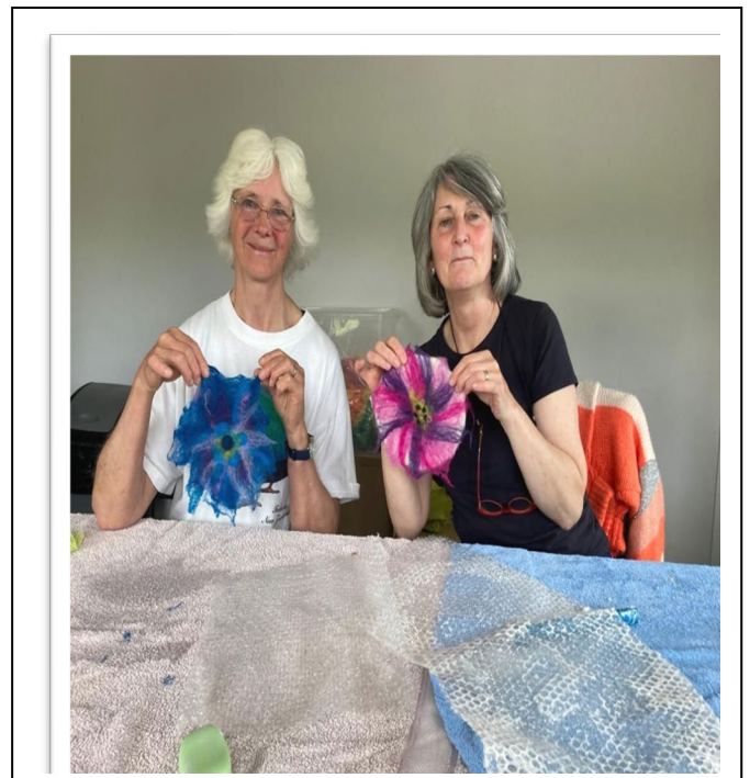
Arts and crafts classes on Whiddy Island.