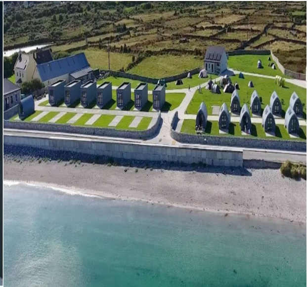
Aran Islands Glamping, Inis Mór