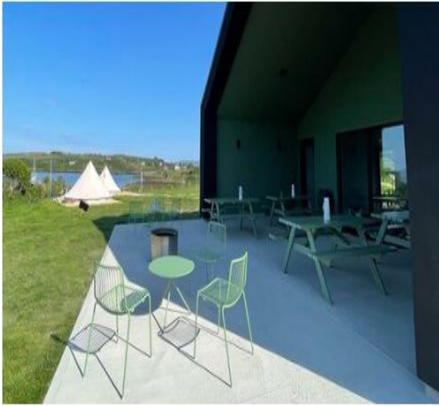
Wild Atlantic Glamping, Bere Island