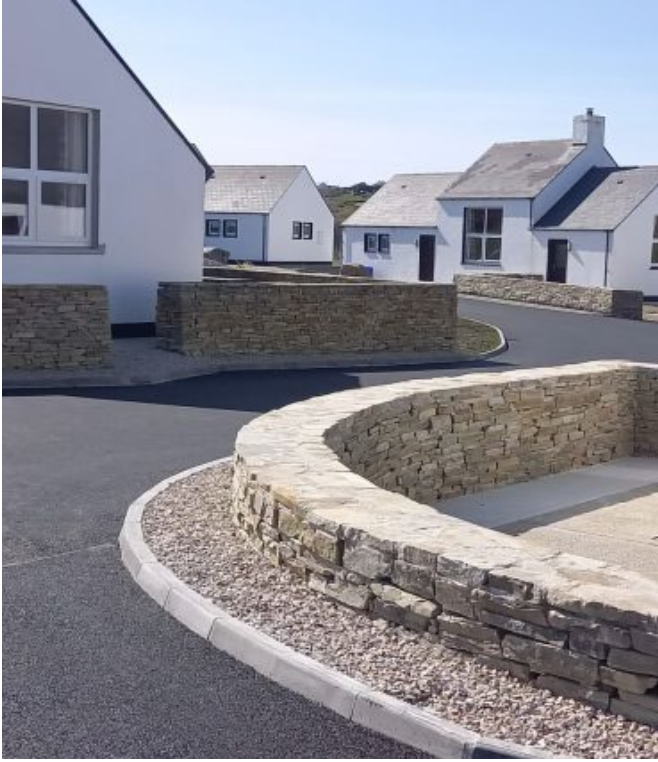
Arranmore Holiday Village

Leave everyday life behind and let yourself be transported to a heavenly place with white sandy beaches, crystal clear waters and glorious peace and quiet.