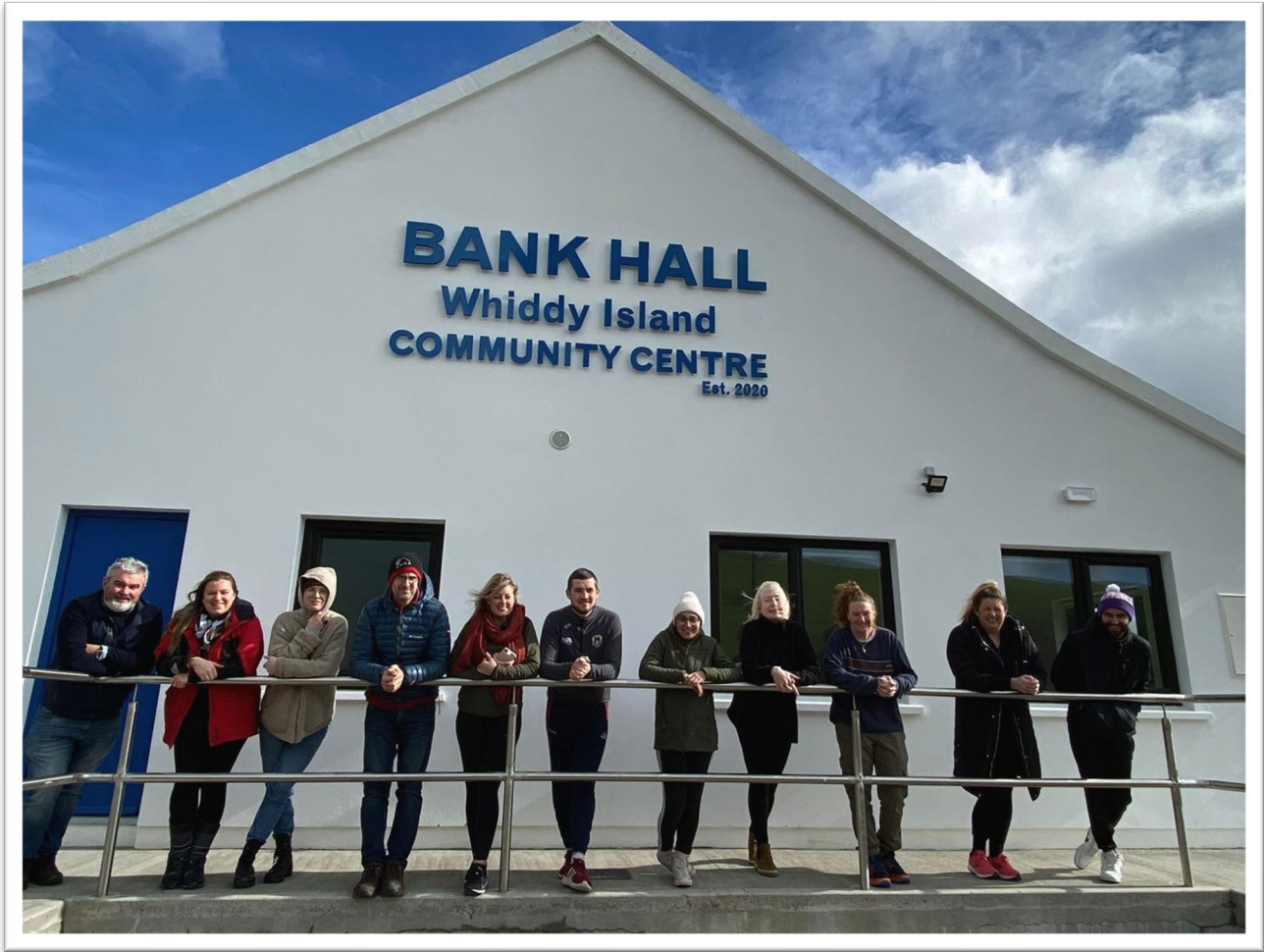
Whiddy Island Community Centre