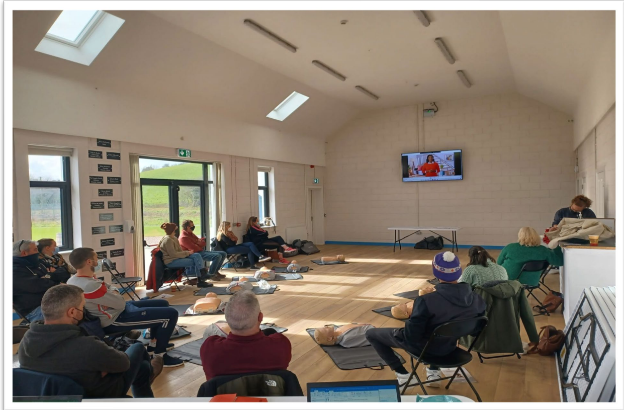
Participants from the Cork Islands at defibrillator training on Whiddy Island