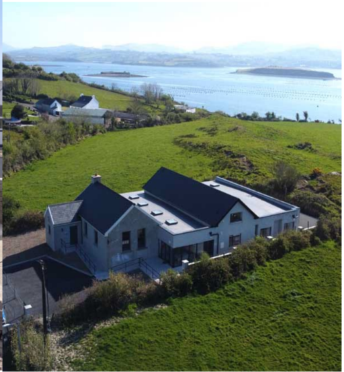
Whiddy Island Hostel